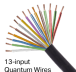
13-input Quantum Wires